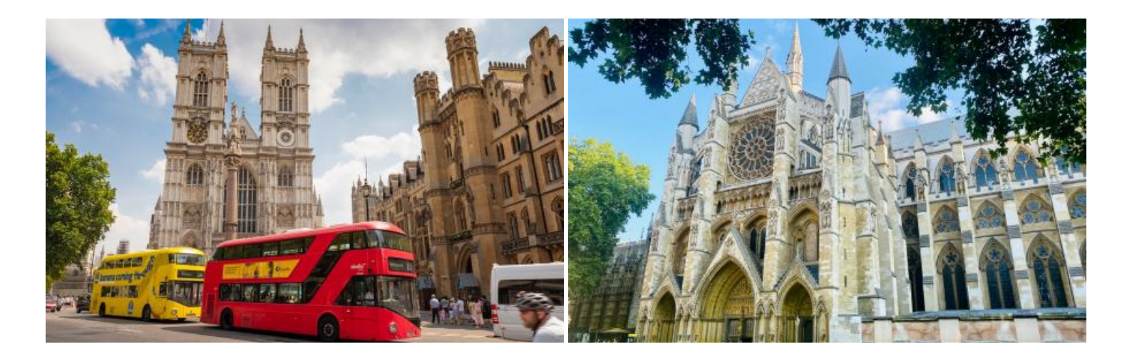
Google Maps Tickets Nearby Hotels