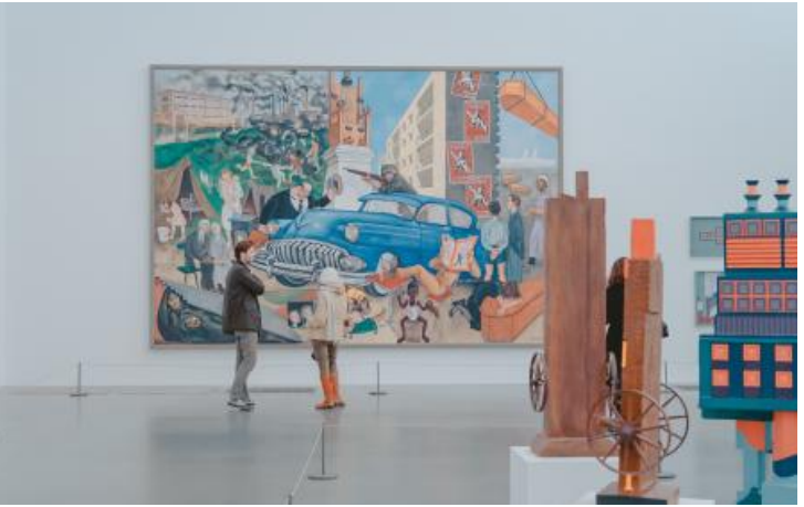
Google Maps Tickets